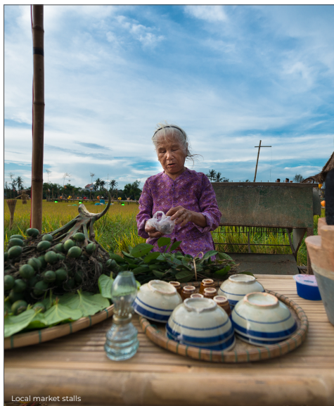
Local market stalls