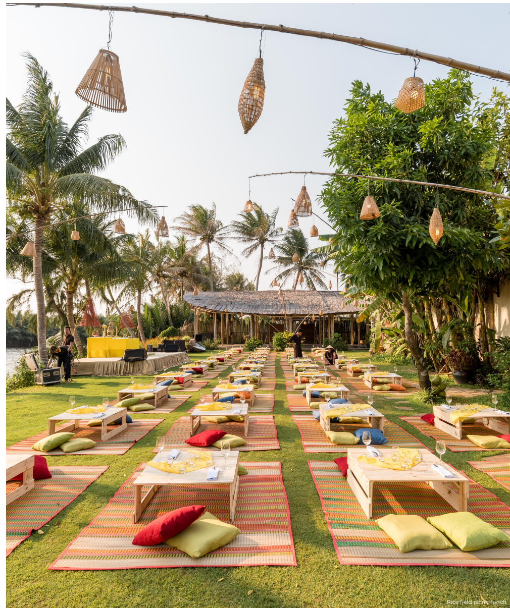
Rice Field picnic lunch