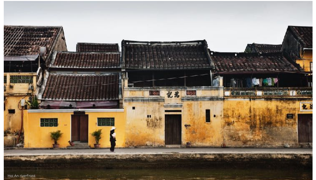
Hoi An riverfront