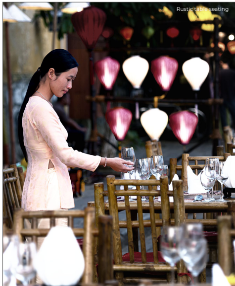
Rustic table seating