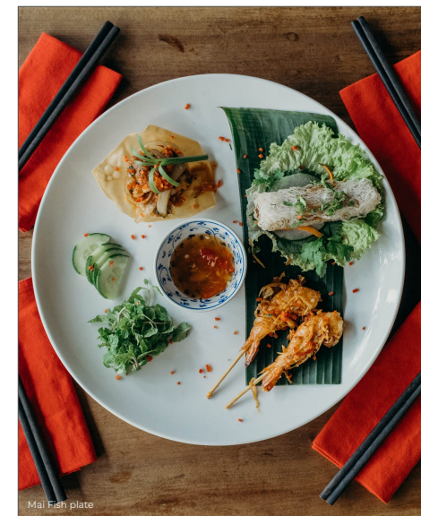
Mai Fish plate

Important Note : Depending on final numbers on the program it may be necessary to source another restaurant or two to accommodate the total group size.