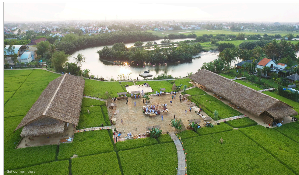
Set up from the air