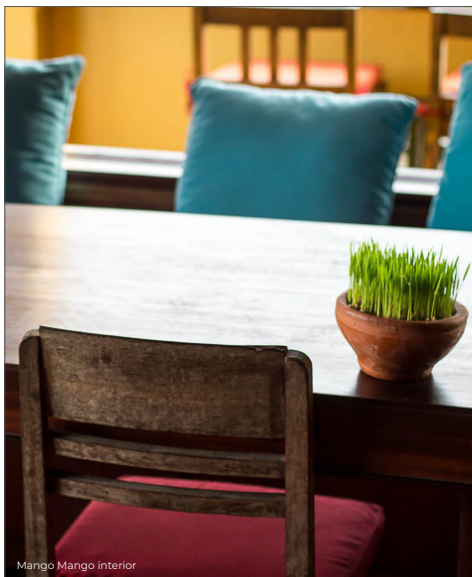
Mango Mango interior