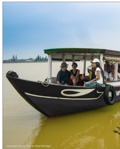
Sampan boat ride to Red Bridge