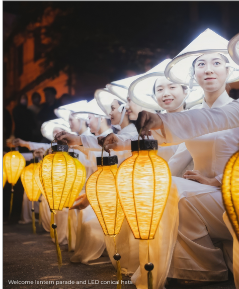
Welcome lantern parade and LED conical hats