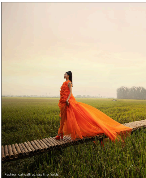
Fashion catwalk across the fields