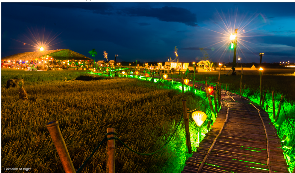
Location at night