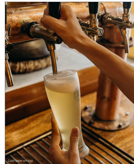
Cold beer on tap

At the end of the evening return to the resort by awaiting motor coach.