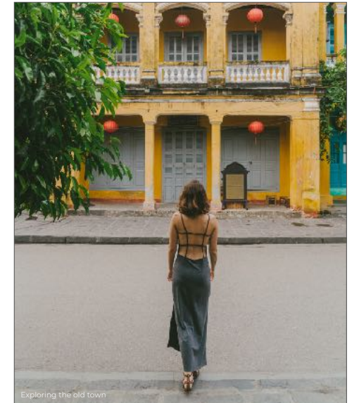
Exploring the old town