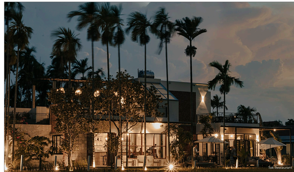
TOK RESTAURANT HOI AN

Tok is a wonderfully unique and elegant restaurant serving beautifully prepared fusion cuisine using the finest local ingredients. Literally in the middle of the rice fields, the location is sublime.