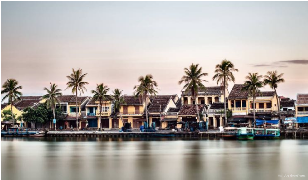
Hoi An riverfront