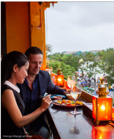
Mango Mango at dusk