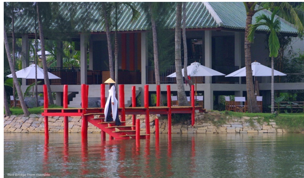
Red Bridge from riverside