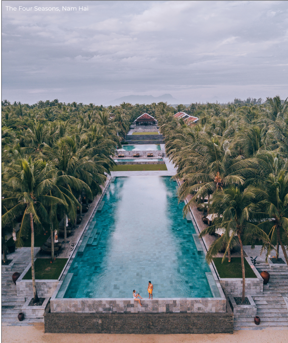
The Four Seasons, Nam Hai