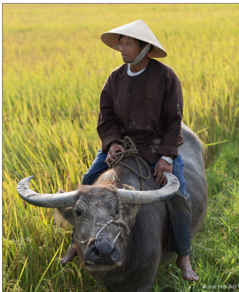
Rural Hoi An