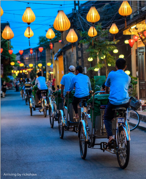
Arriving by rickshaw