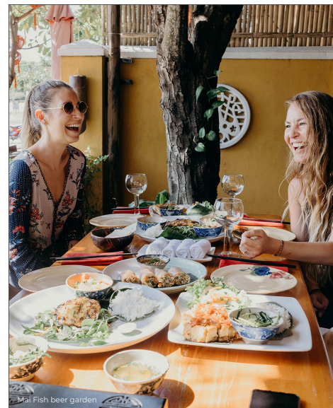
Mai Fish beer garden