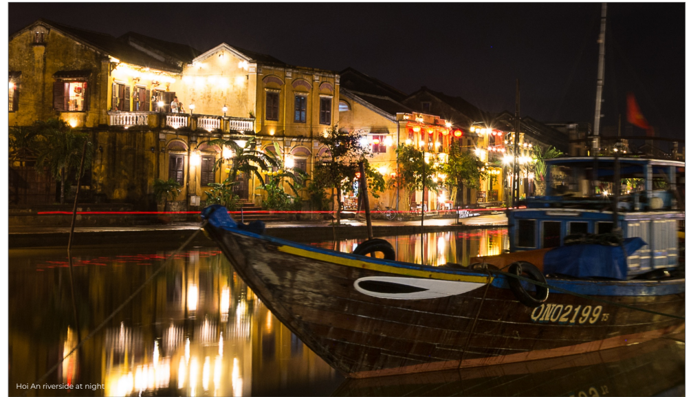
Hoi An riverside at night