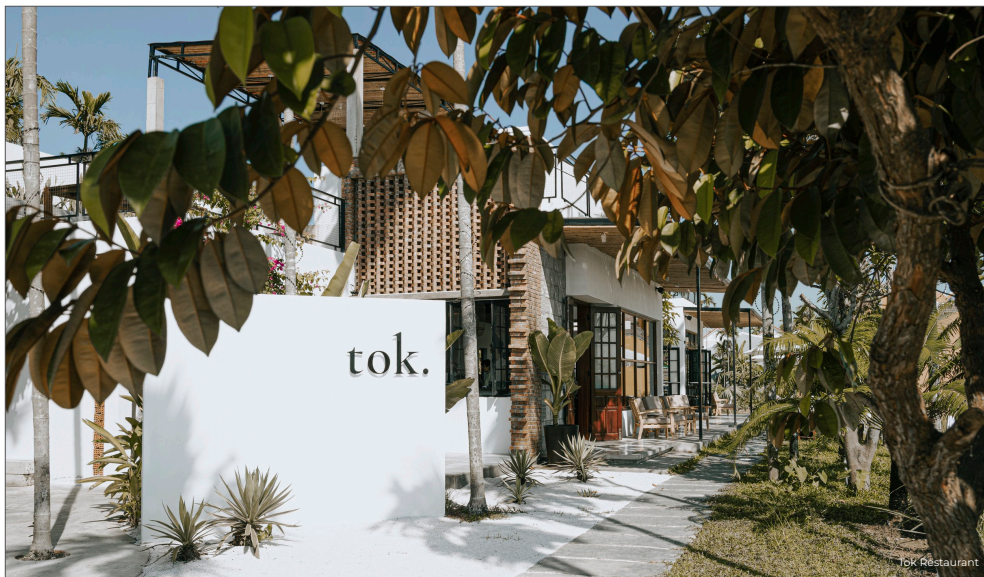
Lunch option TOK RESTAURANT